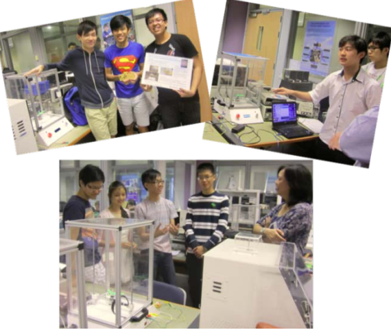
Figure 2. Flying Machine Project

Most of the students commented that they enjoyed the learning activities and the module did stimulate their interest to learn more about Aerospace Systems.