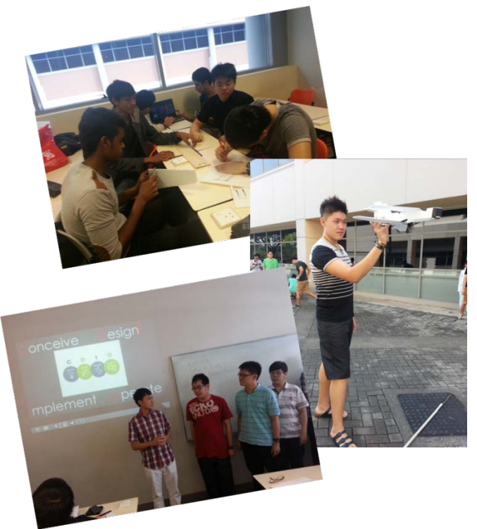
Figure 3. Glider Project

In addition to the competition, each group of students prepared an after-competition presentation, with every member sharing their roles, challenges faced and how their design was conceived and improved on. The learning experience through this glider project has enabled the students to learn through self-discoveries and failures in a safe environment.