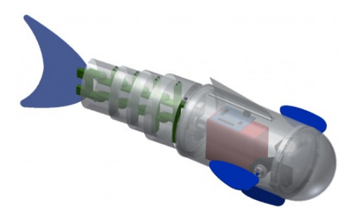
Figure 3 displays the outcome of these two milestones for the swimming robot proposal.