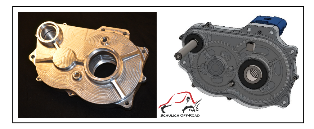
Figure 6: Baja SAE Artefact after 4 Years of Manufacturing Labs

Looking at team operations four years later reveal a significant improvement in the design and manufacturing methods used by the Baja SAE team. Their newest gearbox design (Figure 6) is greatly improved over its predecessors, with the weight of the entire assembly reduced by over 7 kg and custom manufactured gears with the correct heat treatments and surface finishes being used. The biggest improvement, however, lies in the casing design itself. Members of the Baja team explain, "The biggest issue we had with the previous designs of the gearbox was the lack of understanding of the machining processes involved. We would purposely design components to be overly simple in order to ensure manufacturability. It was very difficult for us to know what additional processes could be done to improve performance without adding significant complexity to the part."