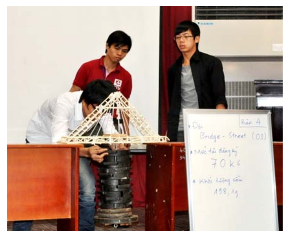
Figure 3. Testing the loading capacity of a bridge model in the "O-Thuoc bridge" Project