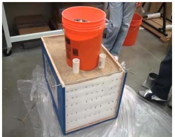
Figure 2. Building the model of Retaining Wall from carton paper at DTU

Another basic project usually held during the junior year is the "O Thuoc Bridge Building" project which helps integrate and apply knowledge from the courses of Strength of Materials and Structural Analysis. Specifically, students are asked to design and build a bridge model from wood or bamboo chopsticks with a specified span length and solid structures that can sustain certain amounts of weight and load. The instructor will grade teams based on their ideas for some new structures of the bridge as well as their choice of materials when building the bridge in reality. The ultimate evaluation criterion, however, is the ratio between the weight of the bridge and the weight that the bridge can withstand. A small competition show can be set up, in which the bridge models of students will do "weight-lifting" against each other until the last one stands as the winner.