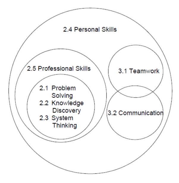
Figure 4. Venn diagram of Professional, Personal and Interpersonal Skills (Crawley, 2001)

It can be said that while personal and interpersonal skills are of a general nature, they are closely-tied with professional skills, which include professional behaviour at work and professional integrity codes by the industry. Professional skills, on the other hand, are tied up with technical skills and knowledge of a specific discipline or industry. This interrelated relationship may be best described schematically in the Venn diagram in Figure 4 below: