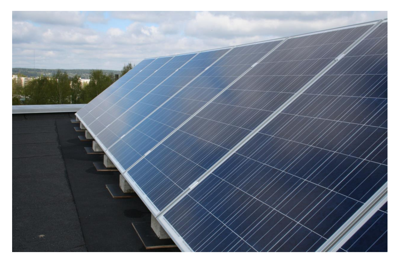
Figure 2: The first panel string installed