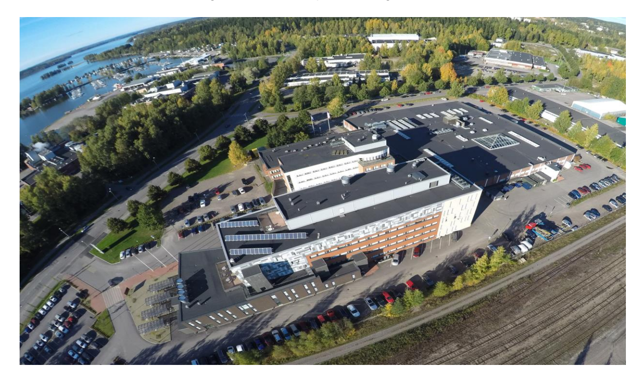
Figure 3: The "bird's eye" view of the location