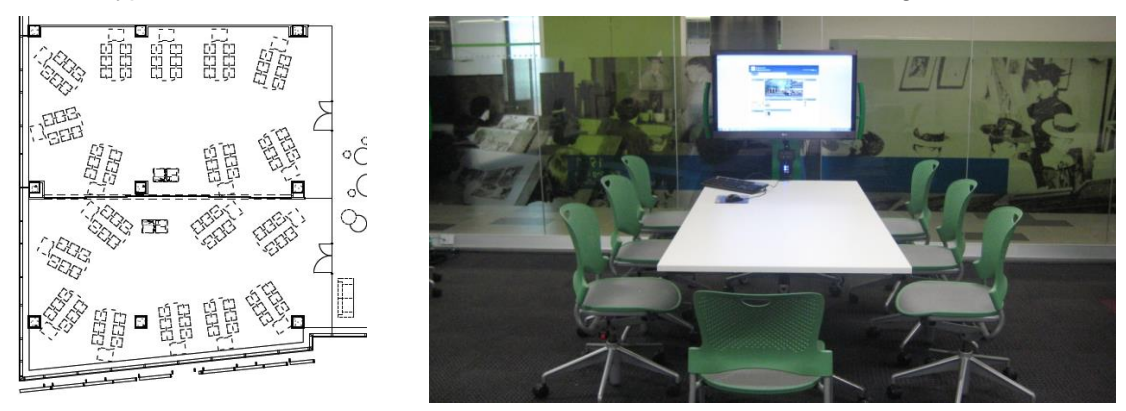
Figure 1: Collaborative Learning Space plan and fit out

A plan and typical fit out for CLS used in this unit at QUT are shown in Figure 1.