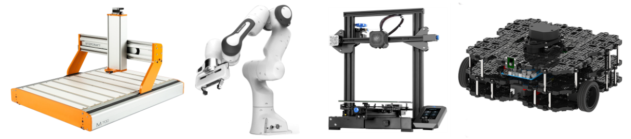
Figure 2. desktop production assets (low-force/scaled) with industry-standard interfaces.

training. Dependent on the machine type, a minimum number of students/staff can be required to check-in at a machine before it may be operated. Next, the production/assembly line in the learning factory employs a specific type of equipment: lower-force/scaled machines, but with control systems identical to the controllers on industrial-scale counterparts (see figure 2). With that, the students experience the same interfaces and programming as used in industry, yet at relatively low-cost machines, rendering any errors, mistakes or experiments significantly less impactful. For example, in the assembly line, different types of robots are used that 'speak the same language' (in this case Robotic Operating System (ROS)) as any full-scale version. The same yields true for e.g., the automated guided vehicles (AGV), or controllers of the desktop CNC-machines. With that, it is certainly not the intent to make the learning factory as robust as possible – rather, by design, resilience is an inherent part of the thinking behind its design.