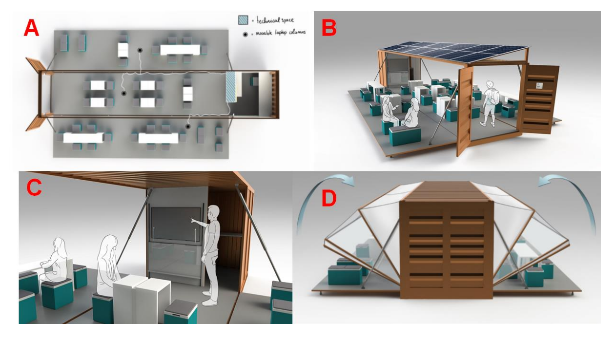
Figure 1. A: top view of the EduBOX; B, C: 3D view of the EduBOX; D: view of the canopy structure.

The final design of the self-contained learning environment exists of two main parts; the first part includes opening sidewalls to expand the classroom's area while the second part includes a small lab in the back of the container behind a separating wall (Figure 1). Figure 2 illustrates the outside dimensions of the EduBOX.