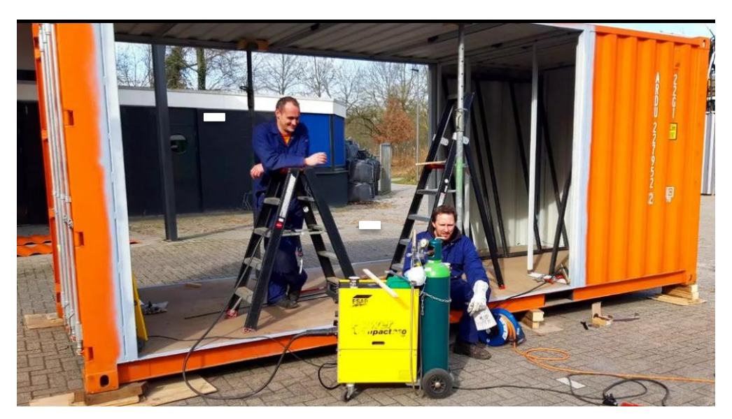
Fig. 3: Prototyping of the EduBOX