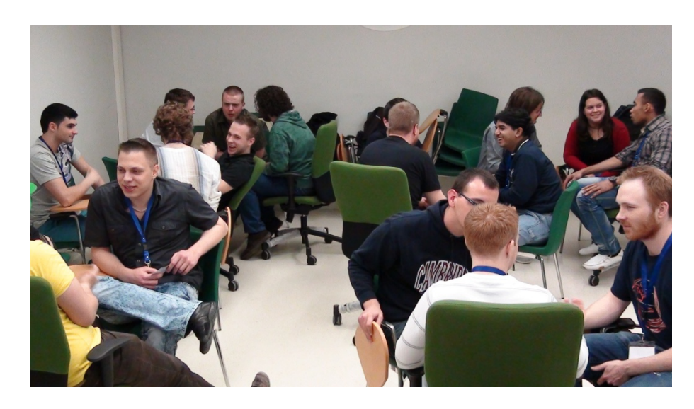
Figure 4. Students in an exercise at the International Communication Workshop.