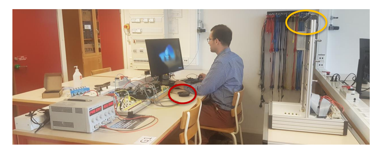
Figure 1. Lab setup for lab session with one student on campus and one student online in hybrid format. The web camera is marked in yellow, and the conference mic is marked in red.

The hybrid learning set-ups were guided by the pandemic restrictions, i.e., the maximum students in rooms, and the need for students to stay at home when experiencing symptoms. In the hybrid format it was possible for both students in a pair to be on campus for the labs, and it was possible for one student to be on campus and the other student to be online and work together. An example of the setup for one student online is seen in Figure 1. The setup facilitated one web camera (encircled in yellow) and one conference mic (encircled in red). The students were communicating online through Zoom, where the student in the lab could share the screen and give control to the other student. Through the conference microphone, the teacher could talk to and discuss with both students at the same time, as if they were both in the lab.