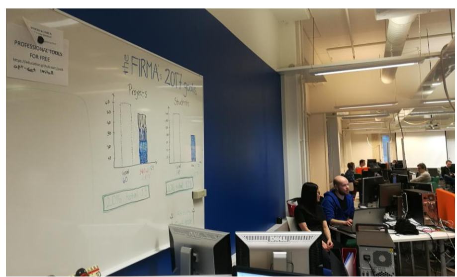
Figure 2. Students working in the FIRMA's office. The FIRMA's brand color is blue, which inspired the students to brighten up the office by painting one wall blue.