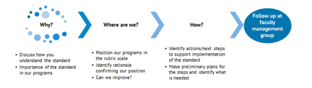
Figure 2. The adaptation process of optional standards at Turku UAS' faculty of Engineering and Business

The process of adopting these new optional standards is presented in figure 2. The first stage "Why" was conducted during the spring of 2021, by the degree programmes discussing how they understand the standard and how they see its importance in their programme. The programme representatives had joint meetings to share their thoughts and ideas. The second stage "Where are we" started in the late spring. A self-assessment form was created to find out the position of the programmes in the rubric scale, to identify the rationale confirming it, and to consider whether they can improve it. All degree programmes conducted this self-assessment process. The findings were collected and discussed together. The third stage "How" to identify actions and next steps to support implementation of the standard and to make preliminary plans for the steps and to identify what it is needed will start in early 2022. In practice this means preparing an implementation plan to be presented first for the faculty management group. In late 2022 it can be evaluated how the implementation process has started.