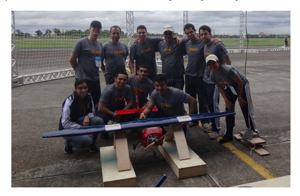
Figure 3. Experimental design-build activity

As an experimental design-build activity, in 2018, students were offered an academic competition for aero model design (Figure 3). The proposed design had simple requirements, such as maximum span length, maximum payload for in-flight transport, deadline for flight test, and written and oral presentation of the final report. With this different activity, it was possible to perceive the enthusiasm, the application of the theoretical concepts learned in the conception and construction of the prototype, the organization for teamwork and, most importantly, the consolidation of the mechanical engineering learning.