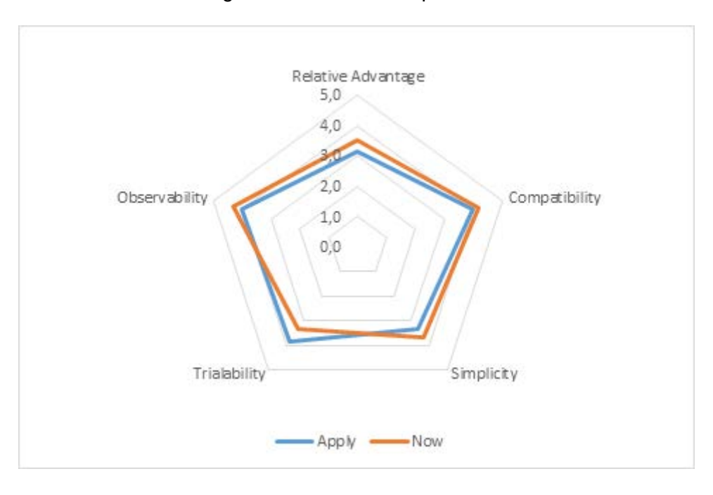
Figure 3. The shift of importance.

The results show that the importance of different CDIO characteristics has slightly changed from the application phase to today. In all areas except one the importance has increased (Figure 3). The only area where the importance has decreased slightly is Trialability.