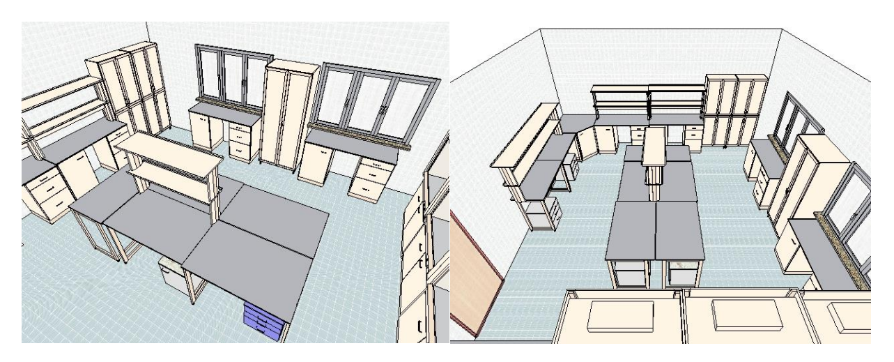
Figure 2. The laboratory design of Drilling Fluid Laboratory: a ) direct view; b) side view

In 2020 the Mirror Engineering Center of CC NTI «New Production Technologies» (Peter the Great St. Petersburg Polytechnic University) on the basis of Surgut State University was created. The aims of this Center in project learning activity are: