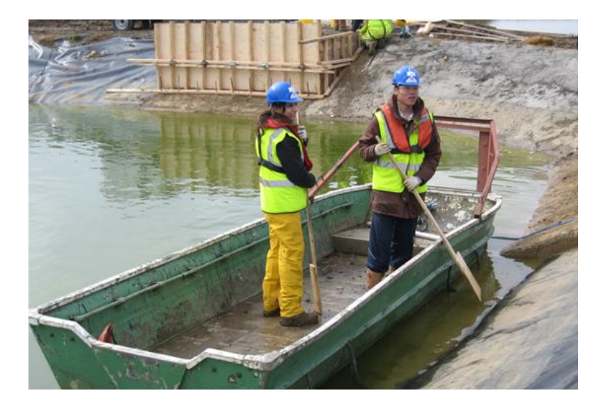
Figure 4 Use of flotation gear