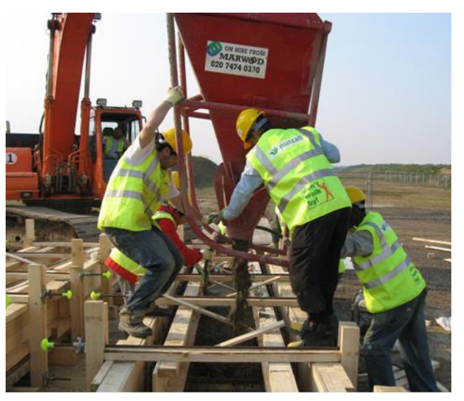
Figure 9 Concreting