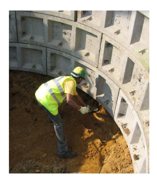
Figure 10 Working at height