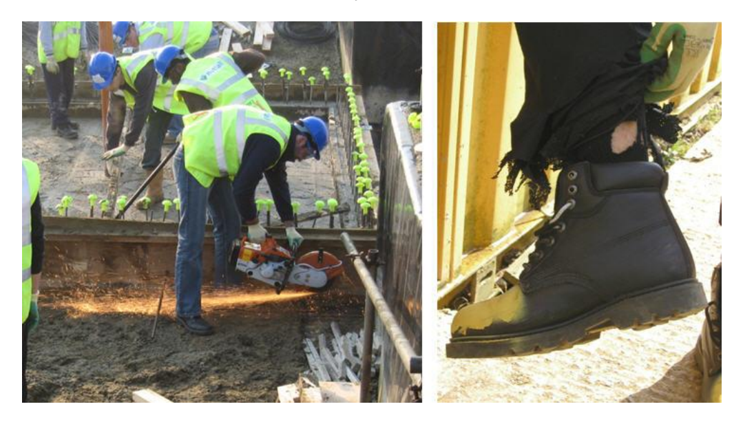
Figure 12 Cutting using steel-saw

• A student using a steel-saw to cut through reinforcing bars and while wearing nylon trousers. The cutting sparks (Figure 12) melted the trousers and caused minor burns to the leg. All students had previously been advised to wear clothing made from natural fibres. This will be more closely monitored in future.