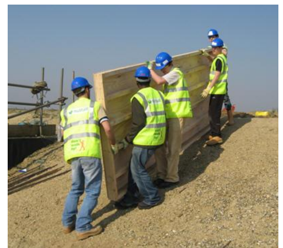
Figure 7 Manual lifting