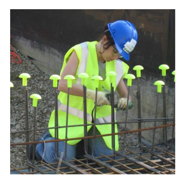
Figure 8 Steel-fixing