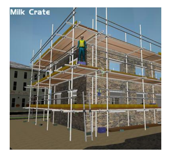
Figure 2 Construction site health and safety virtual reality package