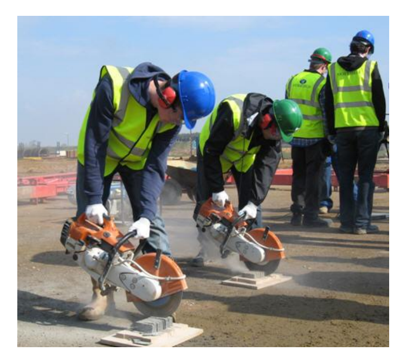
Figure 3 Students with appropriate PPE using power tools

Personal protection equipment is provided partly by the students themselves and partly by the Contractor. All students must purchase their own steel toe-capped safety boots for use on site. The contractor provides high visibility jackets, construction helmets, safety eyewear and rubberised cotton gloves. These must be worn by every student at all times while on site. In addition for further activities some specialised PPE is required and supplied. Wood or steel cutting operations involving dust and noise are carried out by students wearing a suitable dust mask and goggles, together with ear defenders, Figure 3. Operations over water are carried out by students wearing personal flotation safety equipment, Figure 4.