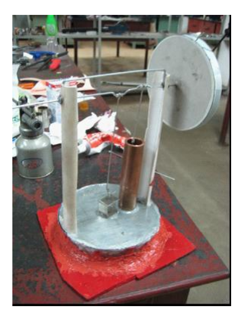
Figure 1. Picture of Student-Built Stirling Engine

Given that a design solution was already presented in the step-by-step website instructions, it was anticipated that the design-build exercise would be weak on the Conceive-Design elements but strong on the Implement-Operate elements. To the pleasant surprise of the project organizers, many of the student teams used the Instructables design as a starting point rather than a final design solution. Student teams conceived a variety of improvements on the Instructables solution and performed multiple design-build-test iterations, making the project a full CDIO experience. Details of this will be given later in the paper. A picture of one of the Stirling engine models, taken from a group design report, is shown in Figure 1.