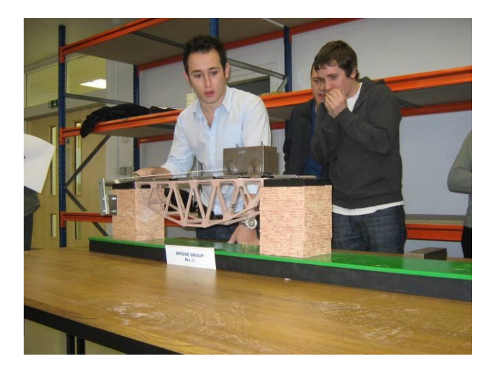
Figure 7. Two Week Creation Part 1 testing

Loading was carried out using a 6 kg weight with wheels, representing a rolling truck load, that was pulled across a hinged aluminium road track, sitting on the top chord of the truss, by a simple pulley system (see Figure 7). There was again a 3.8 kg overload that was tested with a second passage of the truck across the deck.