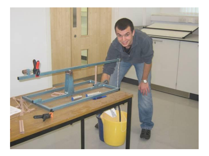
Figure 3. Compression testing machine

The groups were provided with a design for the main truss of the bridge in the form of an A1 drawing, which they could use as a template for the assembly of the various tension and compression members. The members are connected using cardboard gusset plates and glue (see Figure 4).