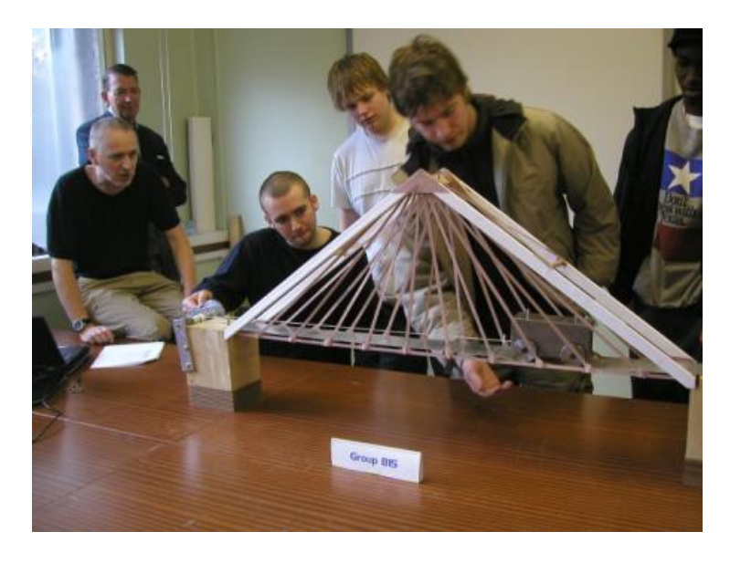
Figure 9. Unconventional truss geometry

The project objective was the design, construction and testing of a third bridge. This time the bridge was required to have twice the span but to carry the same truck load and overload. For the third bridge students were given complete freedom over design of the truss geometry and truss member sections. They were given some information/guidance on the range of types and applications of trusses used in real life bridgeworks. They used this together with their own initiative and design experimentation with the structural analysis packages to conceive their own truss geometry. This resulted in a wide range of truss geometries being adopted. Most groups selected Deck Trusses and Through Trusses but sometimes both! The latter demonstrating their very early stage in the understanding of structural behaviour. However, by this stage in their lecture studies they had covered frame analysis in Structures lectures. They should have appreciated that double chord trusses were an inefficient use of material. One student group in 2007 showed real initiative and imagination by rejecting the above and below deck truss options previously used. With no restriction on height given, they selected a truss comprising two very large compression members making a threepinned arch, with tension members from the apex supporting every bridge deck hinge (Figure 9). Although the compression members were relatively heavy, the overall weight of the bridge was one of the lightest built.