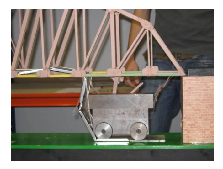
Figure 12. Collapse of the deck cross-beams supporting the roadway