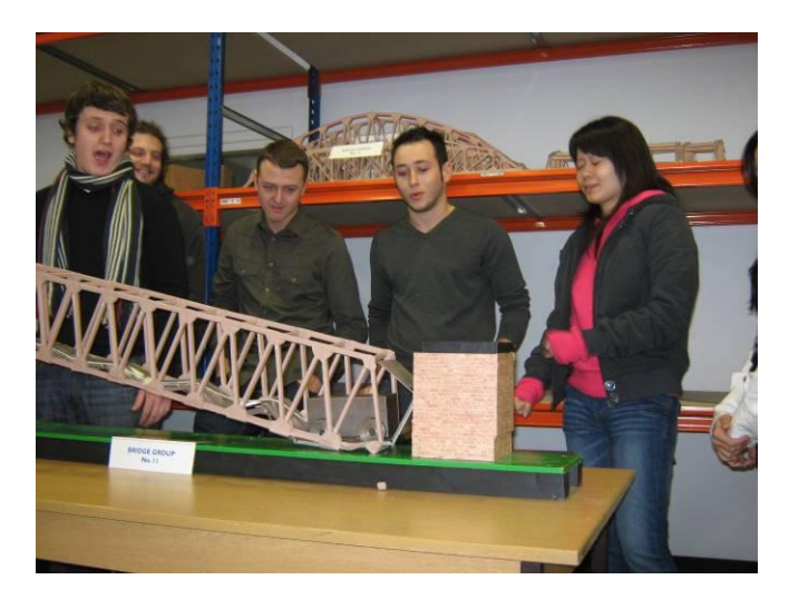
Figure 10. Two Week Creation – Part 2 – End connection failure

The biggest problem encountered for the third bridge was the poor connections detailed at the ends of the road carrying members (see Figure 10). This was in sharp contrast to the well designed and fabricated main trusses. The cross-members were not included in the design of the main trusses and little thought seemed to be given to this detail. Also little thought was given to the lateral cross-bracing that should have been providing lateral stability (see Figure 11).