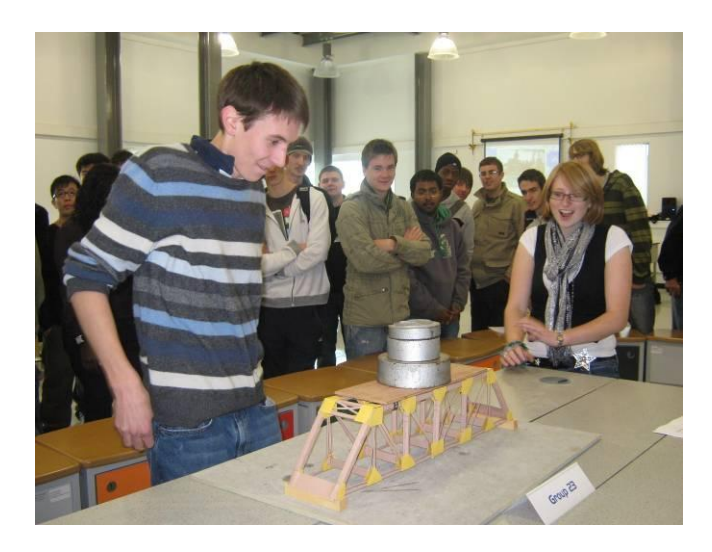
Figure 6. Icebreaker ceremonial testing

On the Friday afternoon there was a ceremonial testing of all bridges in front of all of the Civil Engineering groups (see Figure 6). All groups completed their bridge models and presented them for testing along with a calculated factor of safety and an assessment of the critical truss member. Not all of these factors of safety were within the expected tolerance of the anticipated factor of safety of 2.1.