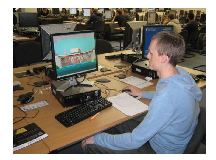
Figure 8. West Point Bridge visualisation software

Students fabricated the members using the techniques learned in the Icebreaker . Some groups optimised the member production into a very efficient production line process. Bridge assembly was generally efficiently undertaken. A design change was deliberately introduced halfway through the project week, requiring a small modification to the geometry of the truss to enable it to fit within the bridge supports provided. This placed each group under a little pressure to modify their designs and provided an awareness that last-minute design changes can and do occur in real life. The test supports and a long ruler were available throughout the week, so that the fit of the bridges within the test bed could be checked. Most (but not all) groups took advantage of this to check the fit of their designs and the quality of the fabrication. Some groups had to undertake late modifications to their bridge fabrication on the day of testing to enable positioning on the non-adjustable bridge supports provided.