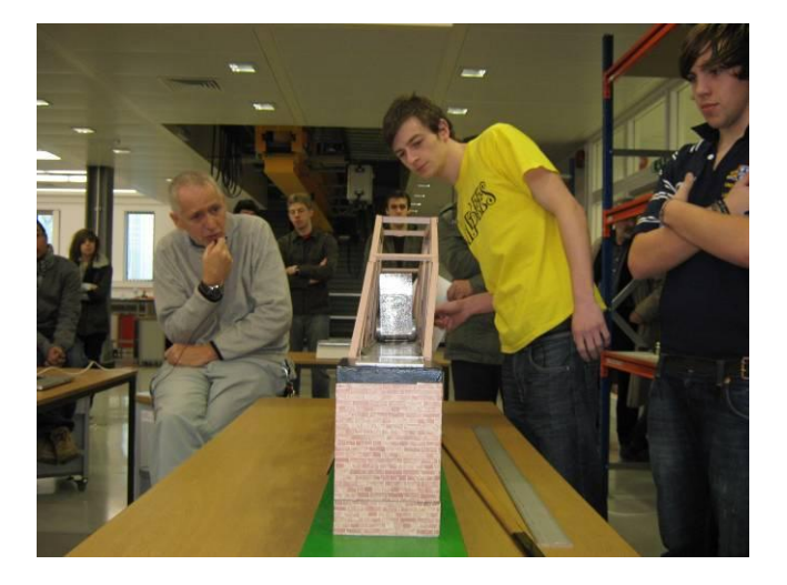
Figure 11. Lack of lateral stability during testing

Proceedings of the 5th International CDIO Conference, Singapore Polytechnic, Singapore, June 7 - 10, 2009