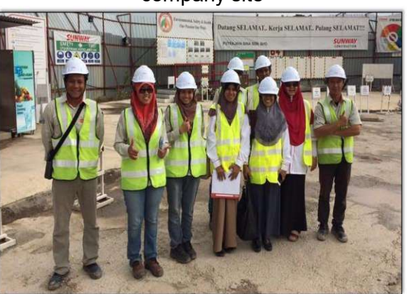
Visiting lecturers on site