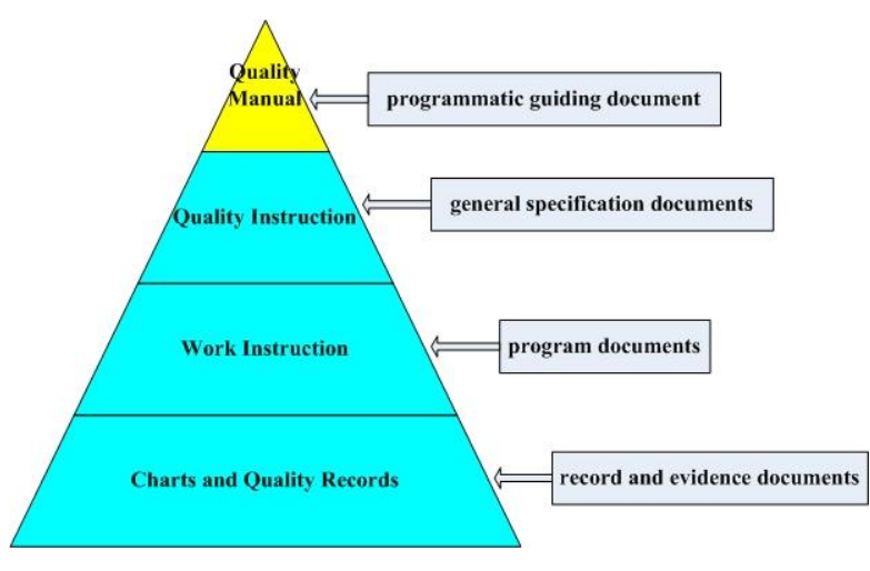
Fig.2 Teaching quality management document system

To ensure successful implementation of EIP-CDIO, we establish a four-level document system as illustrated in Fig.2. Level 1 is programmatic guiding document, i.e. Quality Manual; level 2 are general specification documents including technology, management norms and procedures; level 3 are program documents including plan programs and measures; level 4 are record and evidence documents including identification and evaluation reports as well as records.