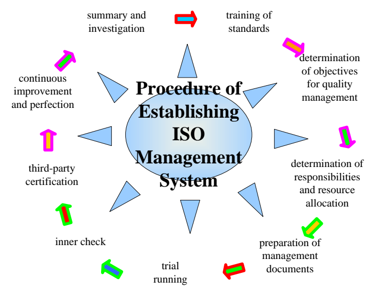
Fig. 1. Procedure of establishing ISO management system

The establishment of our ISO management system mainly includes 9 stages: summary and investigation, training of standards, determination of objectives for quality management, determination of responsibilities and resource allocation, preparation of management documents, trial running, inner check, third-party certification, continuous improvement and perfection.