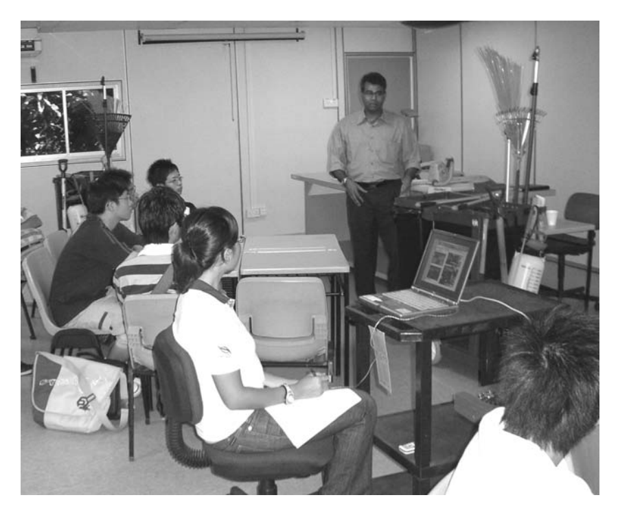
Figure 2 Attending a presentation at National Parks

landscape tools for use in the parks of Singapore. This makes the project authentic and early exposure to personnel outside Singapore Polytechnic is good for students to realise that studies go beyond the classrooms.