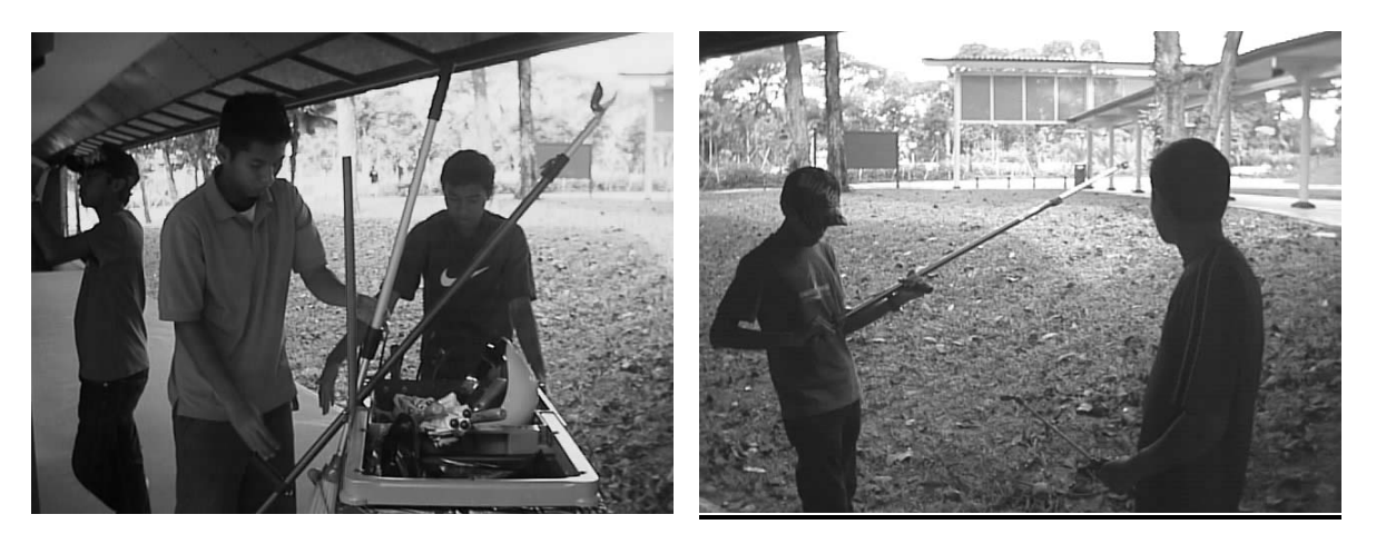
Figure 3 Trying out different tools used by National Parks

Besides attending the briefing session, students are also given the opportunities to try out the tools and equipment whereby they can gain a better exposure. This will help them in understanding the difficulties involved and to derive the potential solutions as can be seen in Figure 3.