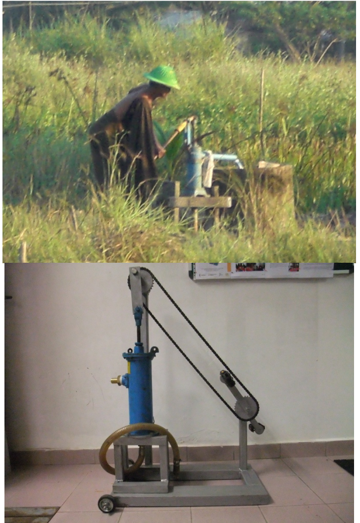
Figure 4: (Top) A Myanmese man in a village in Yangon using a hand pump to draw water from a well. (Bottom) A modified hand pump designed by the students that uses paddling action to provide physical force to move water.

Finally after proving the functionality of their designs, the students implemented both the water filtration system and modified hand pump in villages in Yangon.