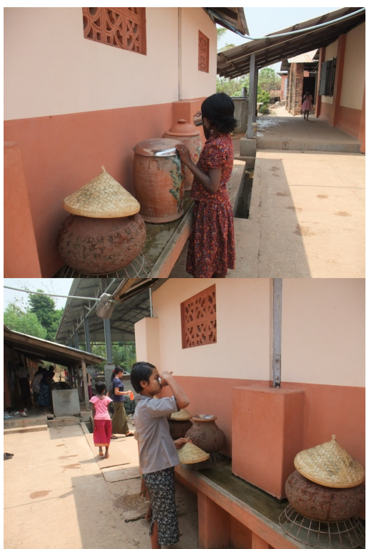
Figure 10: (Top and Bottom) Myanmese children living in an orphanage in Yangon drinking water using shared cups from small ceramic pots. The cups are not washed before or after drinking.

Based on these findings, the students made the following inferences and interpretations: