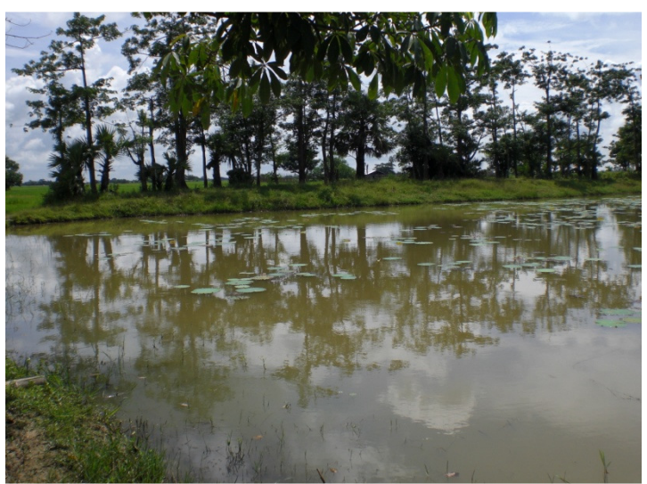
Figure 3: A typical pond in villages in Yangon. The local village people dig such ponds to collect rainwater. The rainwater collected is then used for drinking, washing, bathing and even agricultural uses.

Based on their research, interviews and pictures taken from the first recce trip, the students were able to develop the following frame: