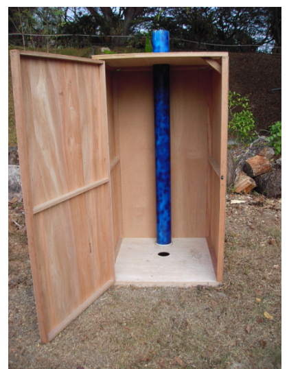
Figure 7: A full-scale pit latrine in SRCS campsite.

Subsequently, the students tested and chose an optimum diameter of two inches for the vertical pipe. Length of the vertical pipe was selected to be eight feet to ensure that it would be taller than the pit latrine of typical height six feet. They obtained permission from Singapore Red Cross Society (SRCS) and constructed a full-scale pit latrine on SRCS campsite (refer to Figure 7). Finally, the students implemented the full-scale pit latrine in Yangon (refer to Figures 8 and 9).