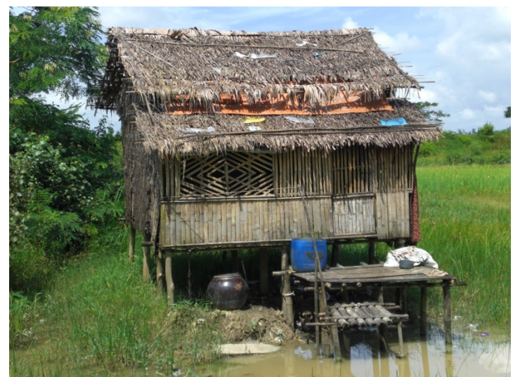
Figure 2: A typical house in villages in Yangon. The houses are usually constructed of bamboo sheets and thin planks of wood. Earthen vats in front of the houses are used to store water collected from ponds.

To obtain an understanding of the local context in relation to these questions, the students carried out research using internet resources and interviewed Myanmese students studying in SP. One DCHE staff also went on the first recce trip to Yangon for site visits to the villages which revealed more information on the living conditions of the Yangon community, as well as their common practice in obtaining drinking water (refer to Figures 2 and 3).