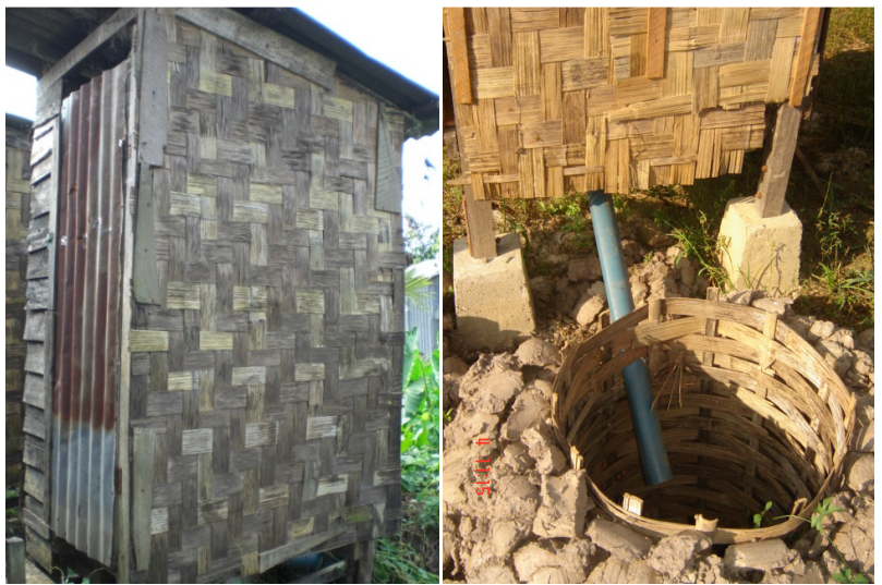
Figure 5: (LHS) A typical pit latrine in villages in Yangon. The pit latrine is constructed of bamboo sheets and thin planks of wood. (RHS) Each pit is typically eight feet in depth with a woven bamboo basket in place for wastes.