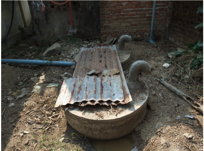
Figure 6: Two covered pits behind the toilet in a church compound in Yangon. A long blue pipe leads from the toilet carrying wastes into the pits. A curved pipe that protrudes from each of the pits is used to vent out smell. It is curved to prevent rainwater from entering the pit