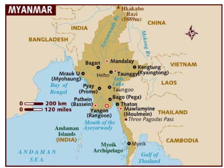
Figure 1: Map of Myanmar.

Cyclone Nargis, the worst natural disaster in the recorded history of Myanmar, caused catastrophic destruction and at least 140,000 fatalities in 2008. Three of the most pressing concerns in the aftermath of Cyclone Nargis are the lack of clean drinking water, poor sanitation and hygiene practices in disaster areas like Yangon, Ayeyarwady (also known as Irrawaddy), Bago divisions, as well as Mon and Kayin states. Provision of clean drinking water, as well as promotion of proper sanitation and hygiene practices are thus of paramount importance to prevent outbreaks of communicable diseases and potential epidemics.