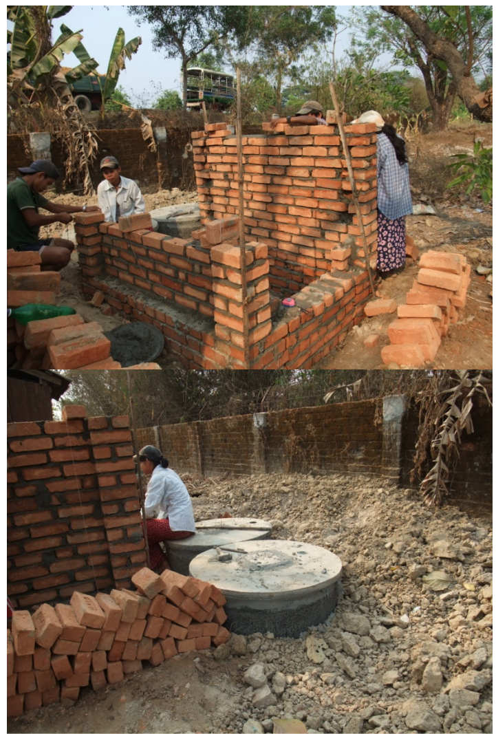
Figure 9: (Top) Myanmese workers constructing the latrine for the sanitation system. The latrine is constructed using bricks. Bricks are more robust materials than bamboo sheets that will be able to support the long vertical ventilation pipe. (Bottom) Two pits have been constructed behind the latrine to contain the wastes. A manhole is constructed for each pit for easy human access to remove the wastes when the pit is full.