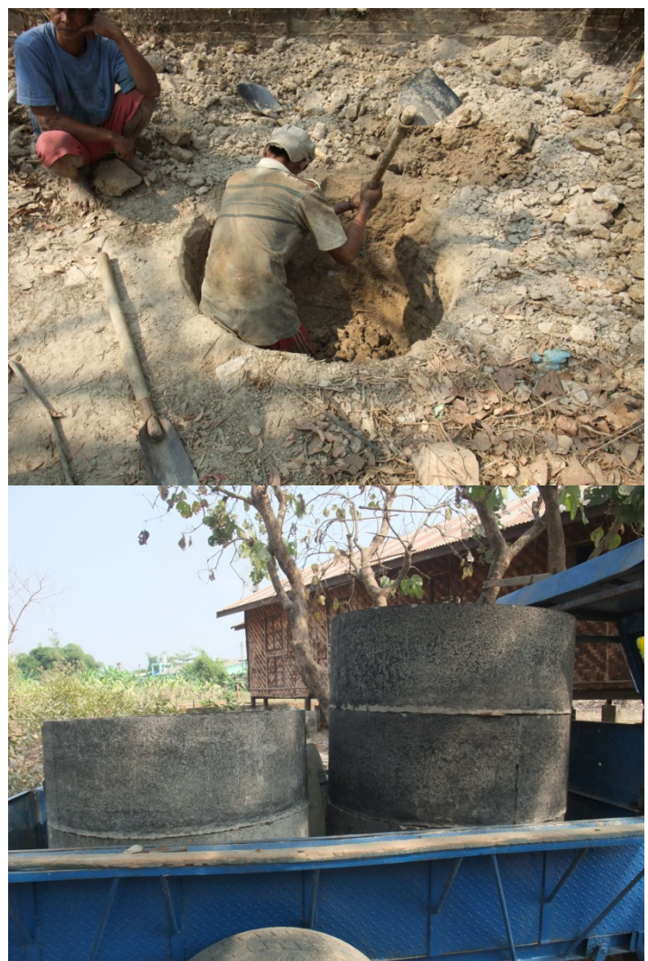
Figure 8: (Top) A Myanmese worker digging the pit for the sanitation system. (Bottom) Concrete rings that will be placed in the pit to contain wastes from the latrine. The concrete rings will minimise risks of contamination of nearby water sources like ponds.