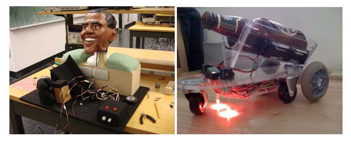
CoinBot: Play and learn

supervised and judged by the instructor and teaching assistants. Often, impressive prototypes are realized (Figure 1). Documentation of several team projects is provided at: http://www.g9toengineering.com/MechatronicsStudio/main.htm.